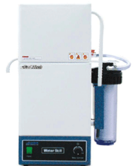
WD-2004F Basic Water Still /w Prefilter